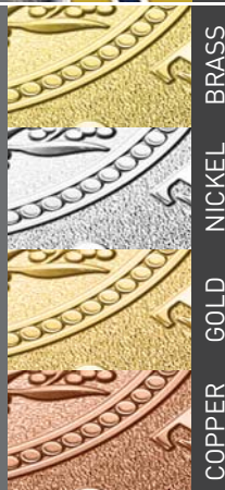
BRASS NICKEL GOLD COPPER