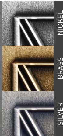
NICKEL BRASS SILVER