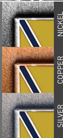
NICKEL COPPER SILVER